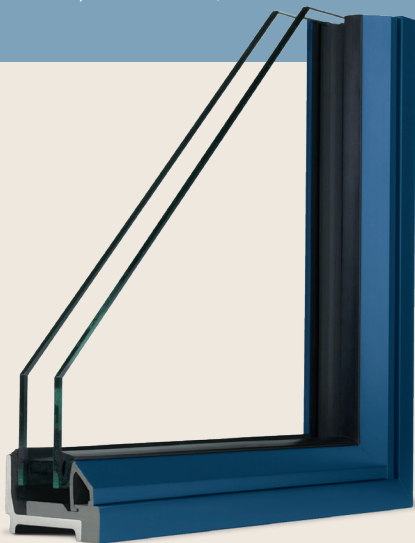
Profile of Hope's® Landmark175™ Series Fixed Window with Thermal Evolution™ Technology

The strength of steel windows allows for minimized frame profiles and maximized glass area, offering the best views. The Hope’s steel windows are a favorite of architects and interior designers because they are custom designed and handcrafted to attain the widest range of design visions—with virtually unlimited shapes, sizes, finishes and profiles. Thermal Evolution Technology can accommodate True Divided Lite (TDL) or Simulated Divided Lite (SDL) muntin systems. Hope’s advanced coating process ensures that all Hope’s steel windows last longer than any other available, even under the most extreme environmental conditions.